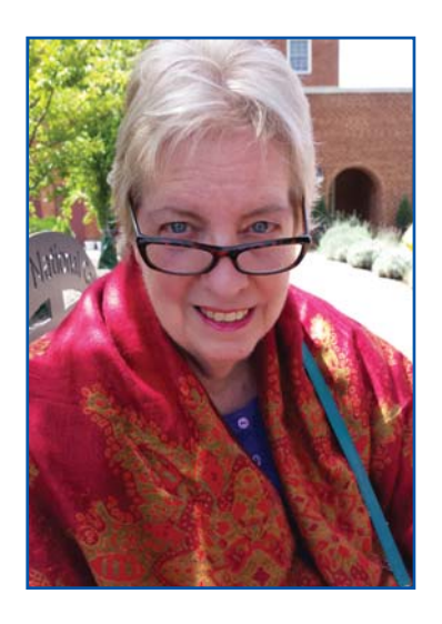
The Art of Connecting