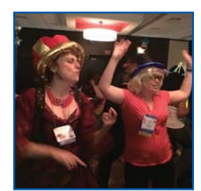
The girls boogie down