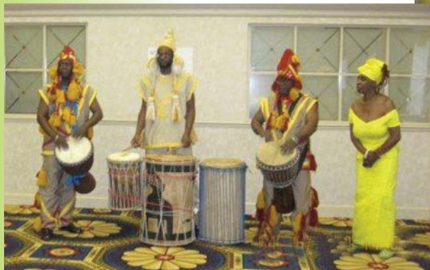
Opening Warm-up - Ubuntu