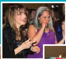
Moreno Milestone Birthday Celebration