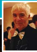
Glitter & Be Gay Dance