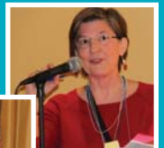
President's Reception / Opening Ceremony